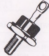
DO 5 (Metal)